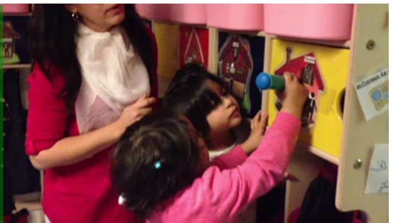
Fig. 2 Left A girl touches the talking pen to a sticker located on a toy. Right A girl touches photos and illustrations of her home and family with the talking pen